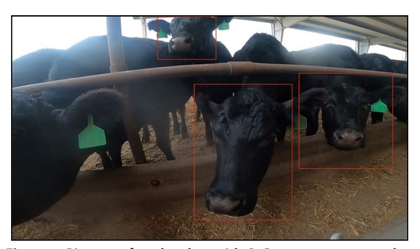
Figure 1 Pictures of cattle taken with GoPro camera mounted on feeder truck. The AI grabs individual images for analyses.

camera images with algorithms such as scale-invariant feature transform (SIFT) or maximally stable extremal regions (MSER), that can be used with machine learning, deep learning or convolutional neural networks for individual identification [15, 16]. The possibilities of muzzle dermatoglyphics with artificial intelligence applications in the early detection of diseases are only now beginning to be explored. In the case of IBK, early muzzle changes that proceed visible signs of disease have not been reported in the literature, but seemed possible prior to this study as the bovine cornea epithelium is densely but only superficially innervated [3], indicating that very early stages of IBK are likely painful to the animal, which in turn could affect the muzzle appearance. Early detection of animals about to break with IBK would be critically important for the development of interventions that prevent IBK outbreaks. Therefore, the goals of this study were to create a database of muzzle images of cattle with and without signs of IBK, to create a pipeline for image